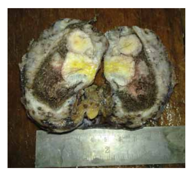
FIGURE 3. Photograph of the surgical specimen, showing an encapsulated structure, with a cystic area with heterogeneous elements consisting of hair, cartilage, bone and yellowish pasty sebaceous material.