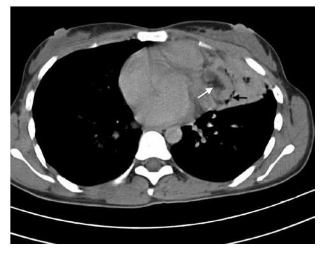
FIGURE 2. Contrast enhanced computed tomography (CT) examination of the chest, revealing a mass in the left lingular lobe with evidence of fat content (white arrow). Presence of peripheral translucency around the lesion confirm the intraparenchymal origin (black arrow), while internal inhomogeneity and the bursting fat configuration and adjacent consolidation suggest intrapulmonary rupture.

ported in 1839 by Mohr<sup>4</sup>. In the literature only 67 cases of primary pulmonary teratoma have been reported up to 2007<sup>5</sup>. Intrapulmonary teratoma is usually diagnosed in the first and second decades of life and involves males